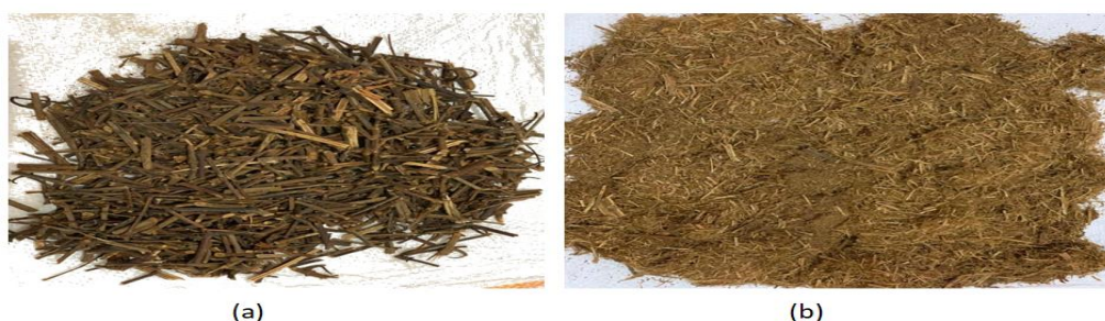
Figure 1. (a) Gambir bransh (b) gambir branch powder

In this study, the sample used was gambir twigs ( Uncaria gambir Roxb.). Before testing, the gambir twigs were cleaned to remove dirt, then underwent an air-drying process to eliminate any residual water from the washing process. After that, the twigs were further dried and ground to reduce moisture content, which serves to prevent microbial growth and extend shelf life (Martiningsih, Kusumawati, Pgri, Puri, & Kartini, 2023). This grinding process is important for preparing the material in the extraction process, as finer particles will increase the surface area of the sample, thereby accelerating and enhancing the efficiency of extracting active compounds such as catechins and tannins. The smaller the particle size, the larger the surface area, which allows for optimal extraction of active compounds (Munggari et al., 2022).