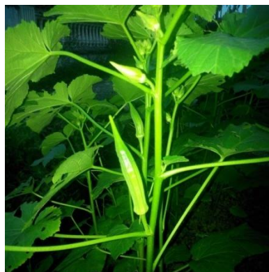
Figure 1. Okra Plants ( Abelmoschus esculentus L.) (Personal documents)

Fungi are microsized organisms, eukaryotic, not plant categories and are capable of causing infections in humans (Sutanto et al., 2008). One type of fungus that often causes health problems is Candida spp, namely dimorphic, opportunistic fungi which are normal flora but if the population increases that can cause health problems including cancer sores, skin lesions, candidauria, candidiasis, female genital infections (Mutschler, 1991; Kurniawan, 2009; Septiadi, Pringgienies and Radjasa, 2013).